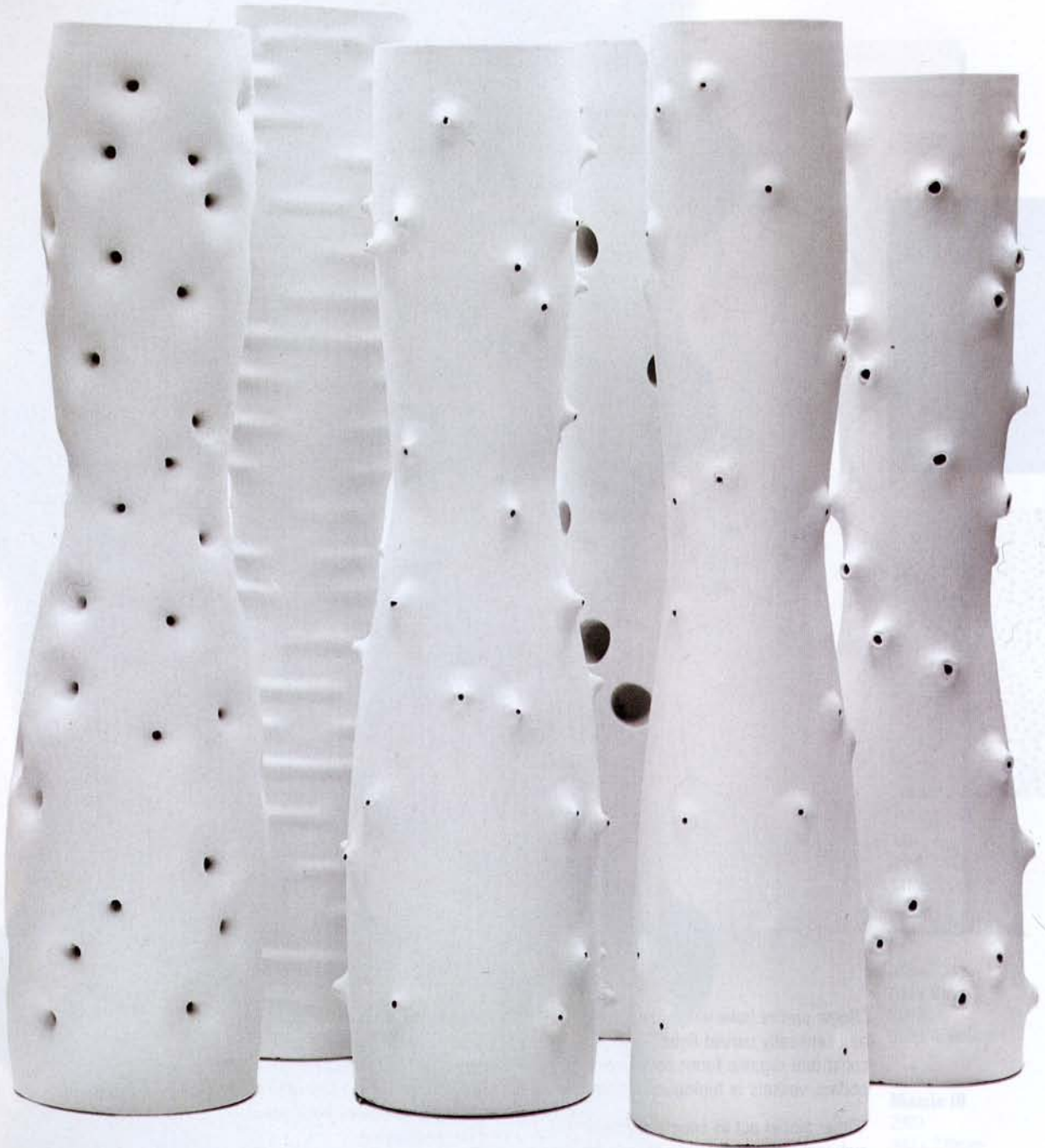
This page: White Clubs 2005 1010 x 230mm